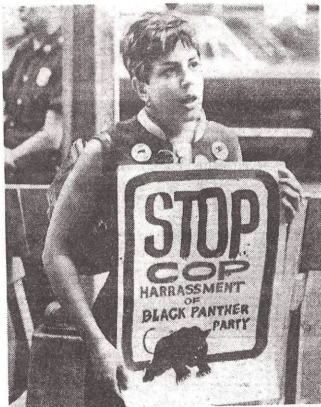
Demonstrator with New York Peace and Freedom party sign marches outside courthouse in support of three men.

** We endorse the ten point program of the Black Panther Party for the black community.